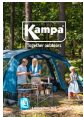
Camping Tents 2023 Catalogue