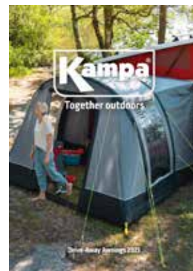
Drive Away Awnings 2023 Catalogue