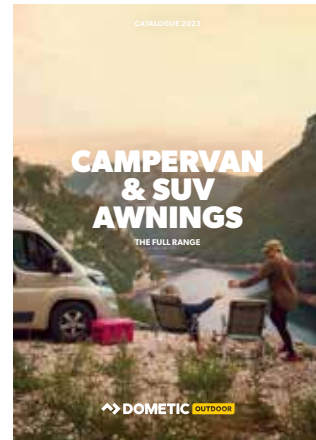
Campervan & SUV Awnings Catalogue 2023