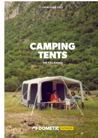
Camping Tents Catalogue 2023