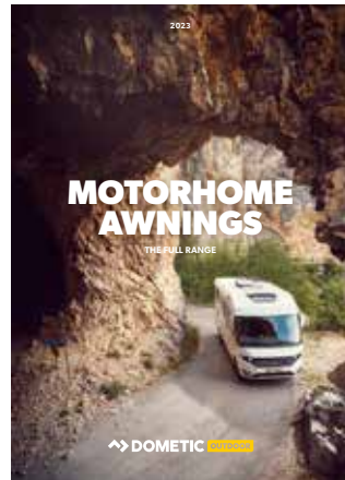
Motorhome Awnings Catalogue 2023